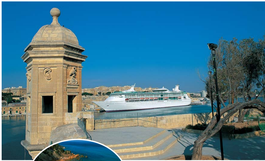
Malta's harbours: a regular port-of-call for cruise-liners