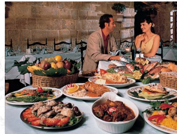
Malta boasts a variety of traditional Maltese cuisine

In contrast, the 250-year rule of the Knights of St John is well documented in archives, architecture and the folklore of the Islands. It was from Malta that the Order defended Christianity from the Ottoman Empire, defeating their long-standing enemy at one of Europe's famed battles, the Great Siege of 1565.