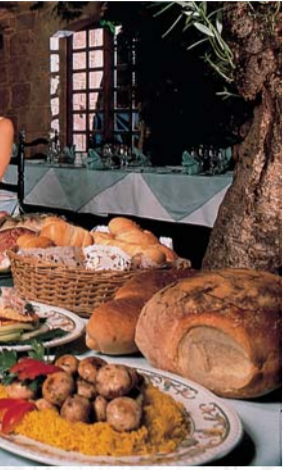
Malta has a varied culinary tradition

In Malta, Mother Nature is the greatest of all architects. On the west coast of the island of Gozo, the surf has shaped a powerful gate in the rocks, known affectionately among the Maltese as the „Azure Window.“ Boat trips embark from the Inland Sea at Dwejra and sail through a rock tunnel out into the open sea