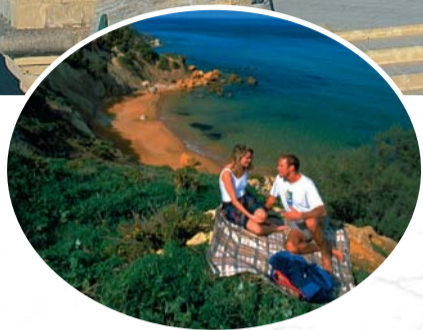
Getting away from it all is easy