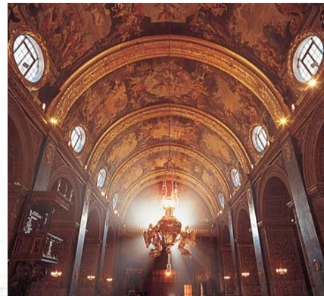
St. John's Co-Cathedral in Valletta

cultures. First were the temple-building people who sailed from Sicily in around 5000 BC, then came the Phoenicians followed by the Carthaginians, Romans, Arabs, Normans, the Order of the Knights of St John, the French and British.