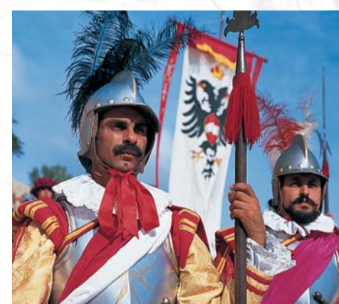
Pageantry, an important feature of the Maltese cultural calendar

Malta's former capital city Mдина sits enthroned and well-fortified atop a rocky plateau in the centre of the island. Horse-drawn carriages roll over ancient cobblestone streets, the utter stillness of the „Silent City“ broken only by the sound of church bells. The Cathedral is a treasure chest of religious art, with works by Albrecht Dürer on display in the Cathedral Museum